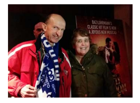
Community outings are numerous, including computer club at the library, date nights, drum circles, Good Will Day at the Highland Yacht Club, grocery shopping and more.